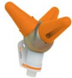
Star Probe up to 6 GHz (FL7006)

Unusual about this trade-in action is that a field probe from any manufacturer can be traded in for a new laser powered AR field probe, regardless whether it is still in working order. The program finishes on 20.12.2007. For further information please contact info@emvgmbh.de