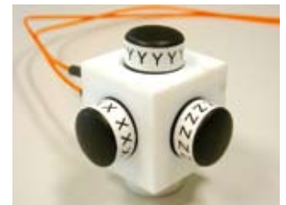
E-Field Probe RadiSense from Dare!!

Among other things, the document considers the influence of anisotropy on EMC measurements, the linearity of E-field probes, and the relevant conditions for calibration of field probes. The white paper can be downloaded from www.emvgmbh.de/emv_news