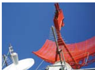
Positioner with AUT

emv and NSI (Nearfield Systems Inc.) refurbish an obsolescent Far-field antenna measurement system at Ramet in the Czech Republic and thereby integrate state-of-the-art measurement instrumentation and the NSI 2000 software with the existing positioner.