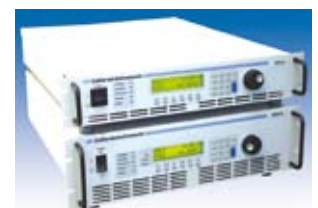
AC Power Source Compact i/iX

emv GmbH in Taufkirchen, Germany, is the sales and service partner of California Instruments in Germany, Austria, Czech Republic, Slovakia und Poland.