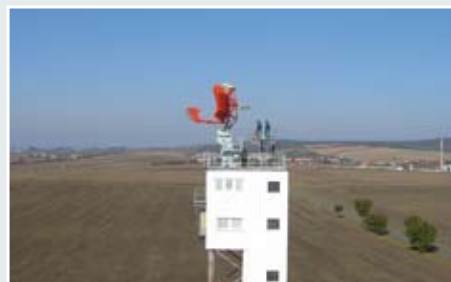
Measurement tower at Ramet in the Czech Republic

Near-field and Far-field antenna measurement systems are employed for the characterization of antennas. Antenna and radar manufacturers demand high standards for the quality and precision of the measurement technology. Older antenna measurement systems are often unable to give the required measurement precision or to deliver detailed measurement protocols. Despite great own maintenance efforts, this was becoming the case at the Czech radar equipment and antenna producer Ramet C.H.M. A 35 year old Far-field measurement system from Scientific Atlanta could not satisfy modern demands. Manual generation of measurement protocols, a high breakdown risk and unobtainable spare parts were some of the reasons for the decision to completely replace the measurement instrumentation and control of the system.