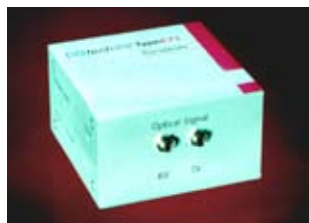
DOtech Type K73 send / receive unit

models can upgrade their existing devices with the new options. The BCI option can be installed on site by customer staff. Each transmission system comprises two send/receive units, connected by a fibre optic cable. Signals can be passed in both directions. The DOtech product line was originally developed from experience in the automotive industry for low-feedback measurements and for signal transfer under extreme EMC conditions. Further Information and all technical data sheets can be found at www.emvgmbh.com .