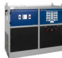
DC Test system ABC-170CE